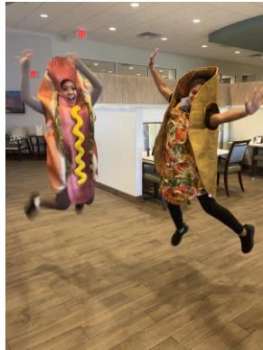
One of our superstar placements at Ashby Ponds, making residents smile during Halloween week!